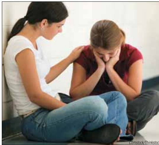
▲ Respect and compassion for others are essential. Treat people the way you'd like to be treated. Make an effort to understand, accept, and appreciate others, and chances are, they'll treat you the same way.

One of the most important things to remember about respecting others is to not judge people who are different from you. Everywhere you look, you see people of different ethnicities, religious backgrounds, and sexual orientations. You see rich people, poor people, men, women, Democrats, Republicans—you name it. The point is, everyone's different, and there's no such thing as "normal." So, there's no reason to draw distinctions between people. Everyone is unique and deserves to be treated with kindness and respect.