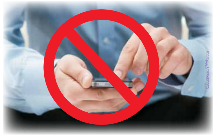
▲ Always act appropriately at work. Do what's expected of you, and avoid what's typically off-limits while on the job!

No one does the right thing all the time. Sometimes it's really hard to do the responsible thing. It's okay to make mistakes. Striving to be a person other people can count on is a worthy goal. Being true to yourself makes you someone you and others can respect and admire. Admitting when you're wrong and learning from your mistakes help you grow as a person. No one expects you to do the right thing all the time or even to always know what the right thing is. The point is to try to live your life with integrity and common sense.